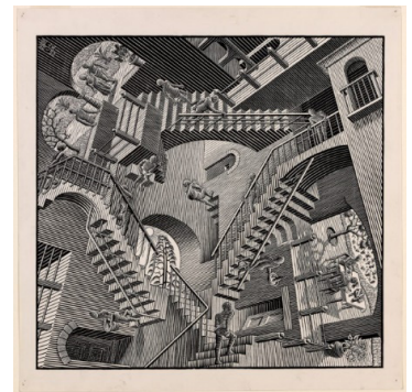
Figure 4 Stone Printing, Maurice Asher, 1953