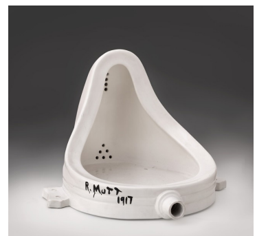
Figure 3 Fountain, Marcel Duchamp, 1917.