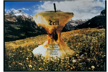
Figure 2 Theater Poster, Holger Mathis

In fact, the graphic designer gives his subjects a different opportunity to be observed (as they are observed now and not as they were already known) and offers a new application of the subject that is now unfamiliar to the audience. Furthermore, he gives the audience a golden opportunity to understand the meaning of the work by contemplating and deciphering the work and enjoy solving the artist's visual project. Defamiliarization of time enables the graphic designer to use a modern puzzle to reconstruct an ancient concept and create awesome, phenomenal, and remarkable puzzles to achieve his goals.